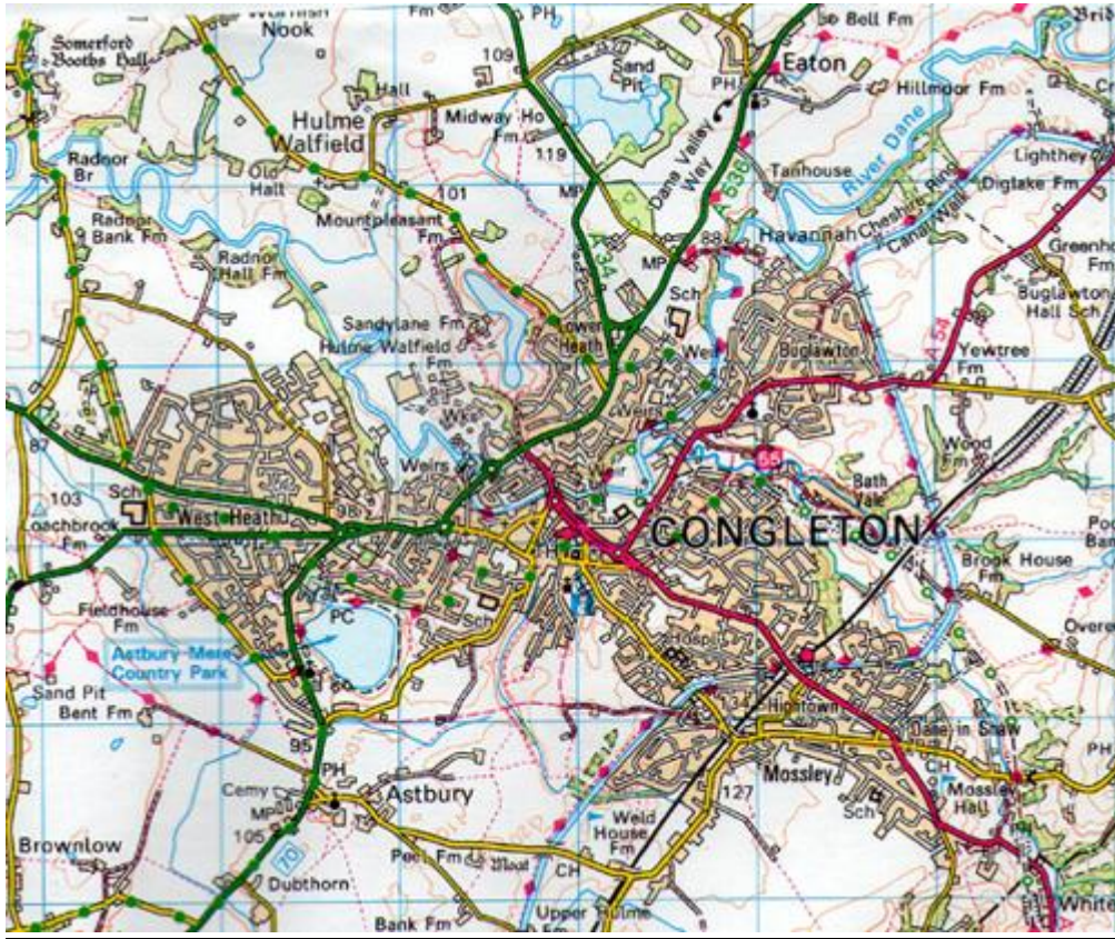
Copied from OS Landranger Map 118. Not to scale.